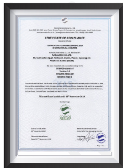
Certificate of COSMOS regarding to Respective items