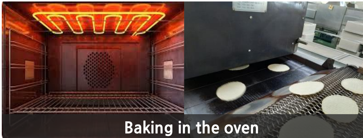
Baking in the oven