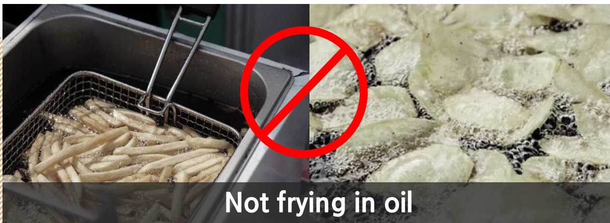
Not frying in oil