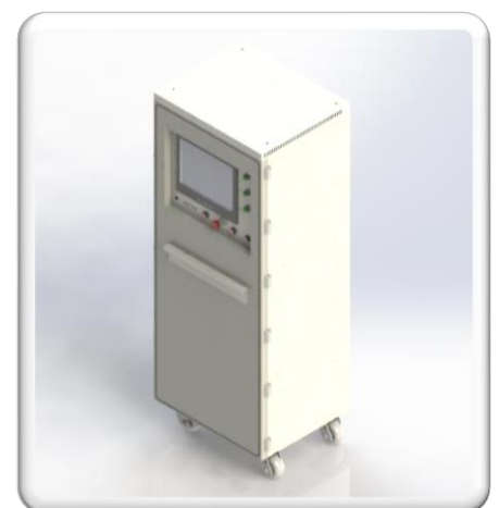
Reactor Saturation Tester