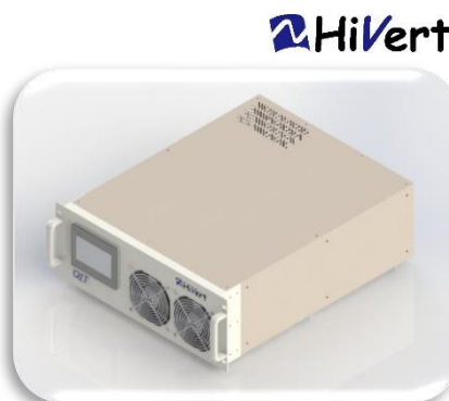
Plasma Generator Power supply