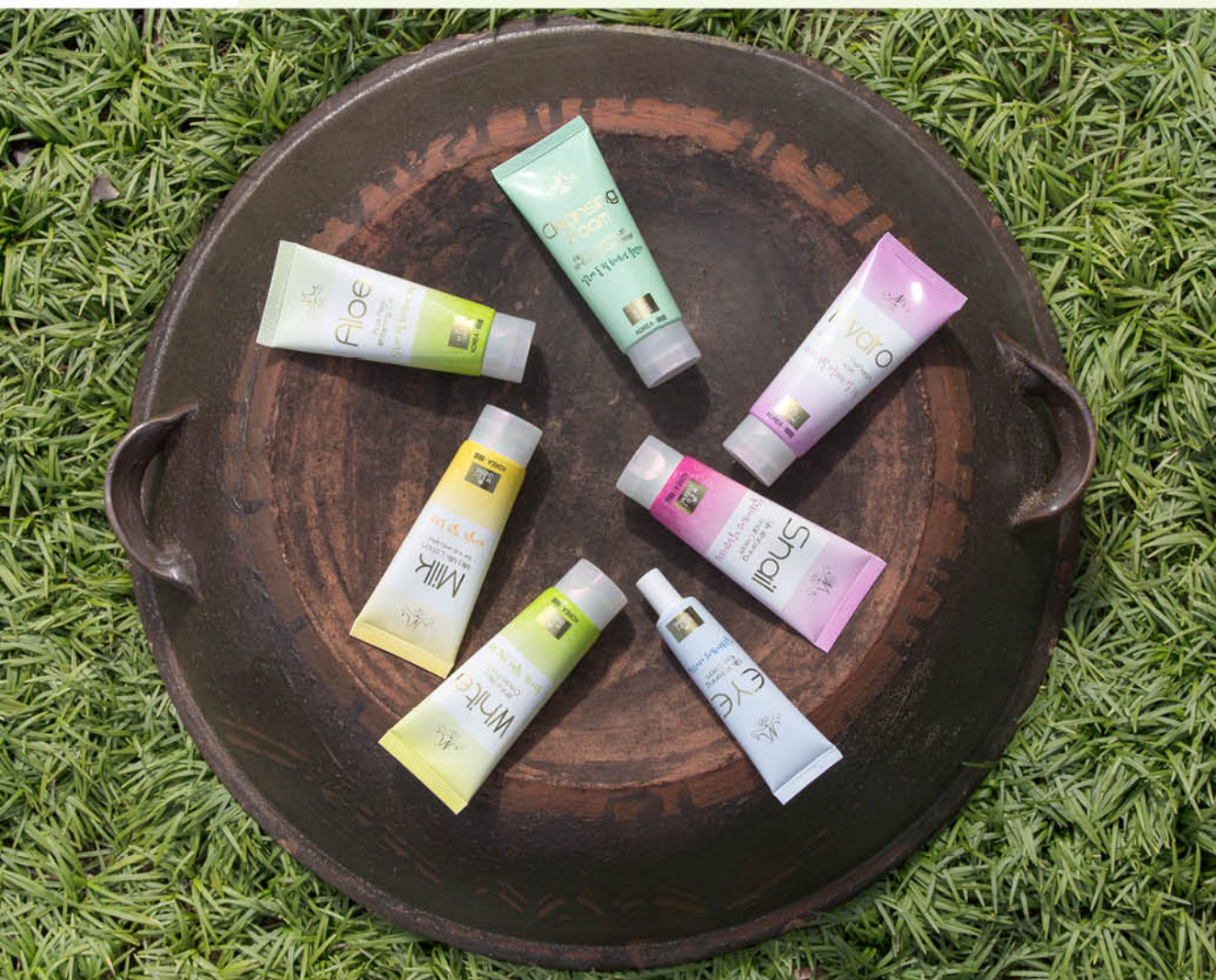
Varieties of Colors on Tubes