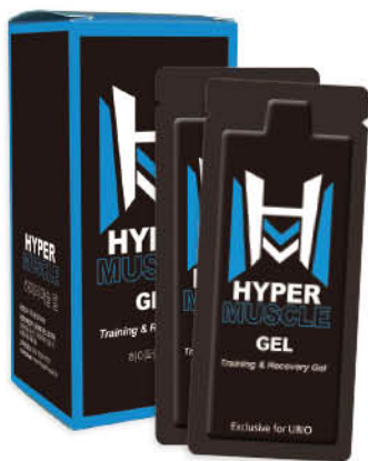
Hyper Muscle POUTCH 5g