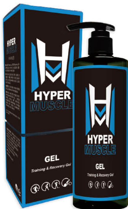
Hyper Muscle 400ml