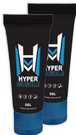
Hyper Muscle TUBE 100g