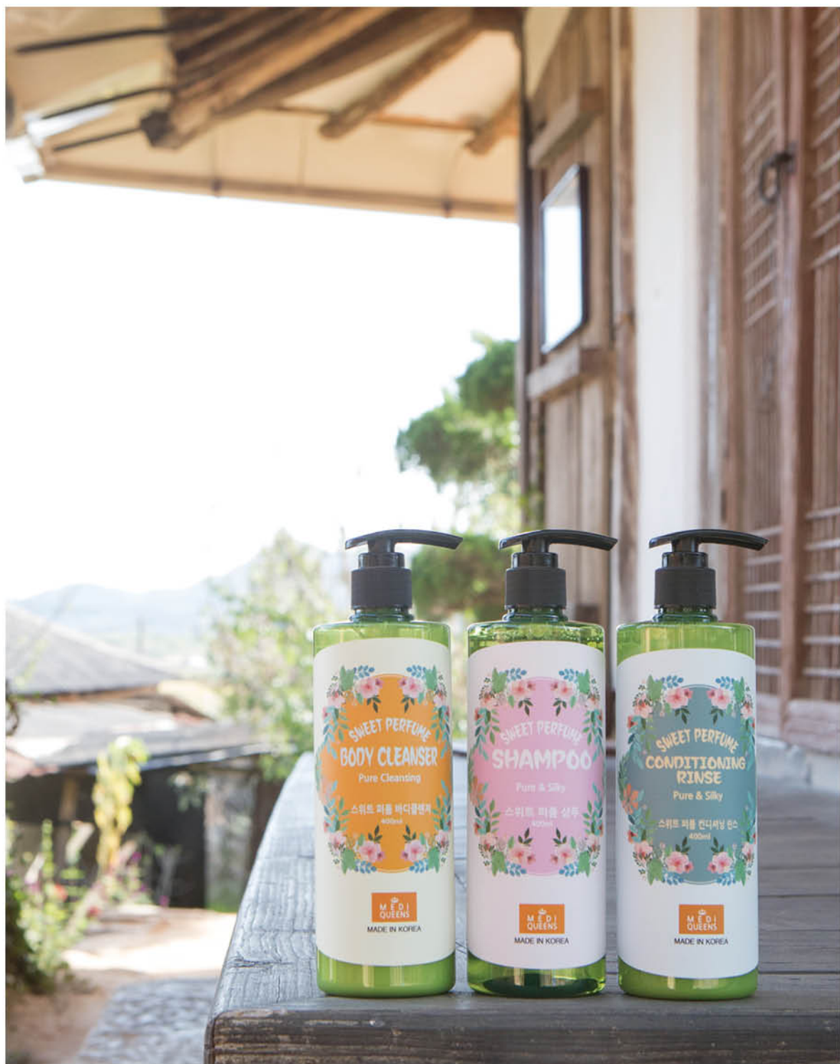
400ml - Daily shower products