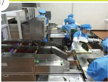
07 Automatic Counting