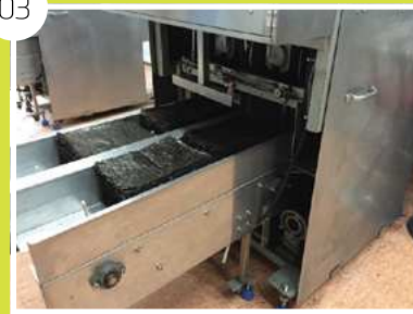
03 Seaweed Sorting