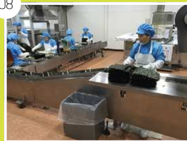
08 Cutting & Serving