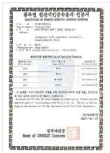
CERTIFICATE OF PRODUCT-SPECIFIC APPROVED EXPORTER