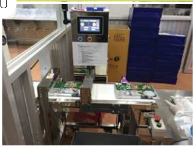
10 Automatic Inspection