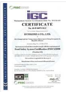
CERTIFICATE OF FSSC22000

Laver is good for our health in the following points. (Laver is the food for longevity which helps prevent geriatric diseases and slows down the aging process.) A treasure house of nutrition rich in inorganic matters and vitamins. Helps prevent fatness by low fat and a low calorie. Abundant iodine helps prevent thyroid edema. Helps prevents hardening of the arteries by lowering blood pressure. A high percentage of calcium prevents osteoporosis. DHA facilitates the cerebral growth of children. Besides, it has the effects of preventing geriatric diseases and paralysis, and contains an ingredient for making eyes clear and useful good for a gastric ulcer. Nourishing food which strengthens stamina