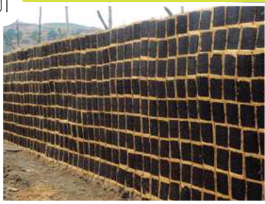
01 Raw Seaweed Purchasing