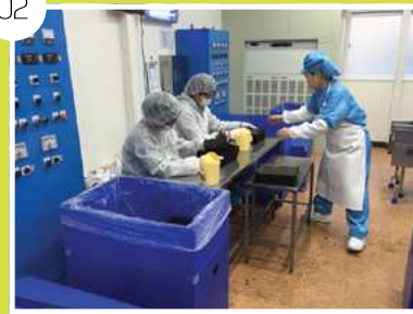
02 Raw Seaweed Inspection