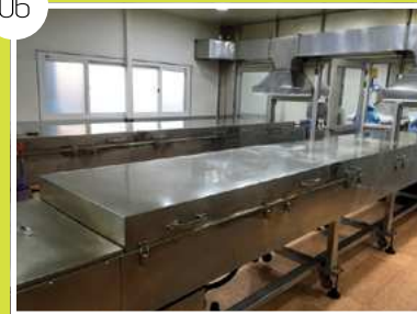
06 Second Roasting