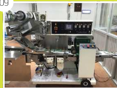
09 Automatic Packaging