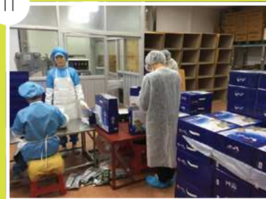
11 Box Packaging