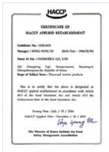
CERTIFICATE OF HACCP