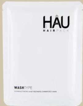
1 pouch individually packed