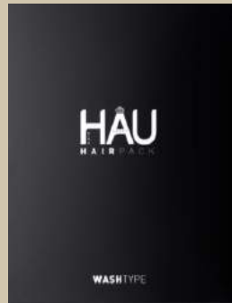
1 BOX (3 Pouches)