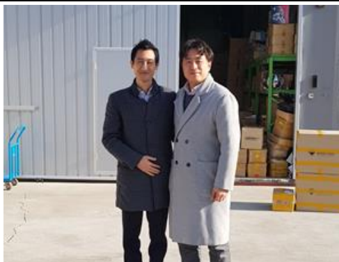
Overseas Sales person with KITA Staff