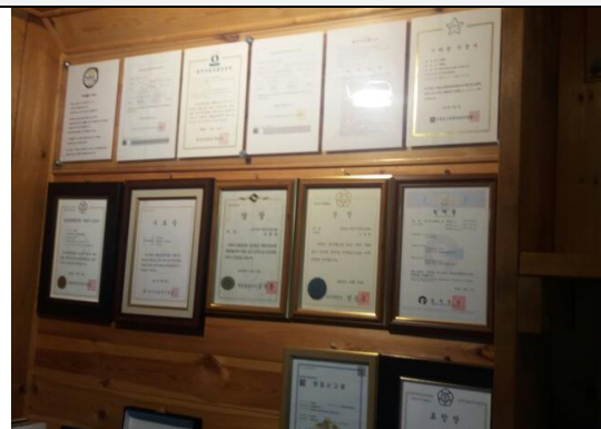
Certification / Business License