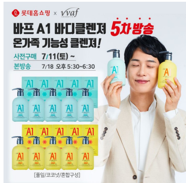
TV 홈쇼핑 인기 상품 TV Home Shopping Popular Products