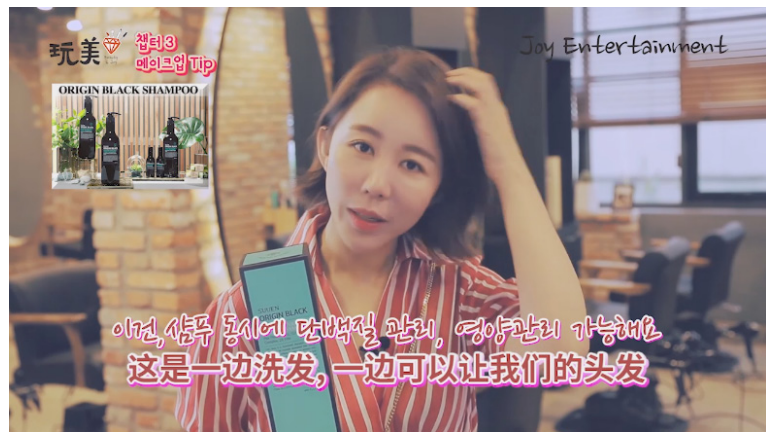
연예인, 셀럽들이 즐겨 쓰는 수앤 오리진 블랙 샴푸 Shampoo used by celebrities, SUUEN ORIGIN BLACK SHAMPOO