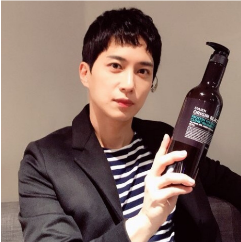
수앤 전속 모델 : 가수 김원준 SUUEN Exclusive Model : Singer Kim Won-joon